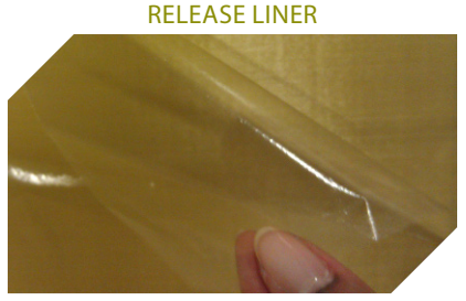
Clear release liner must be removed before use.